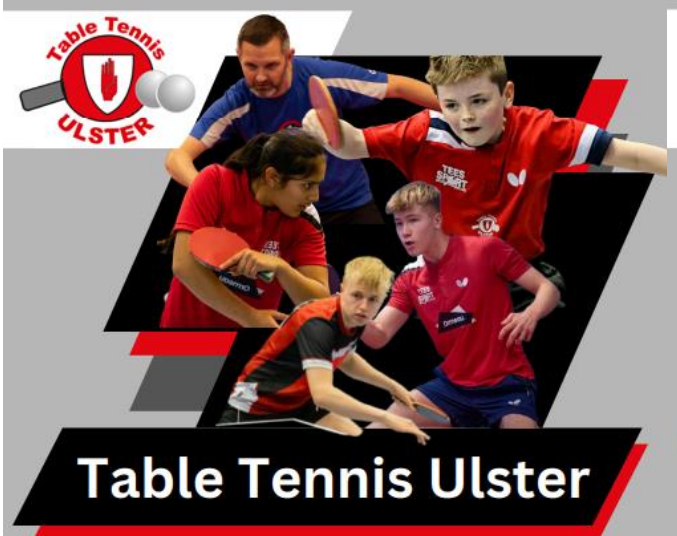
Table Tennis Ulster is responsible for the everyday organisation of the sport in the province of Ulster, and is committed to facilitating everyone from beginners to elite players, as well as our over 50's Bat and Chat players, to help develop their potential and enjoy the sport of Table Tennis.

Our aim is to increase participation, develop clubs and to have the best quality coaching and competition facilities made available.